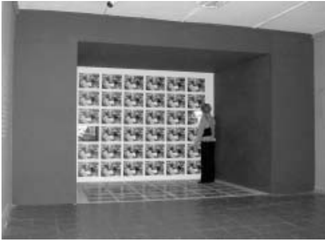
City Horizons - Video-Installation

exhibition in 2002, I showed painting artworks and installations. In 2003, I was awarded at the X Colombian Artists Regional Salon , the most important exhibition of the artistic zones in my country. In 2004 I made a large-dimension installation at the 39 th National Artists Salon of Colombia , held at the Bogotá Modern Art Museum , the maximum expression of the Colombian Contemporary Art . This year I was also chosen to represent Colombia at the International VSA Art Festival (for artists with disabilities) in Washington D.C., together with representatives of Canada, India, Panama, Japan, France and the United States. In 2005 I was granted a Pollock-Krasner Foundation Inc.'s fellowship to improve my living standards as an artist and help me in my degenerative disease. My commitment before the foundation in New York was to make artworks and to labor in the artistic field with people with disabilities in Medellín. In 2006 I was granted the Pollock-Krasner Foundation Inc.'s fellowship again to continue to help me in my degenerative disease, with my commitment to evolve as an artist. Additionally, during the last 3 years, I exhibited collectively at the United Nations Headquarters in New York, Joseph D. Carrier Gallery (Connections 2 Abilities Festival: A Celebration of Disability Arts and Culture), Toronto, Canada, City Museum of Washington D.C. , U.S.A., Gallery of the John F. Kennedy Center for the Performing Art , U.S.A.