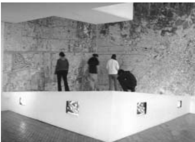
Without borders - Video-Installation

In 1995, I carry out my first collective exhibition for people with disabilities in Colombia. I also achieve my first individual exposition this year with about 20 artworks; the next two years I work in order to accomplish in 1997 another individual exhibition. Besides, I was chosen to represent Colombia at the International Visual Arts Institute in Washington D.C., and would attend a workshop as fellow Yamagata, held at the Corcoran School of Art, together with other people selected from India, France, Mexico, Ja-