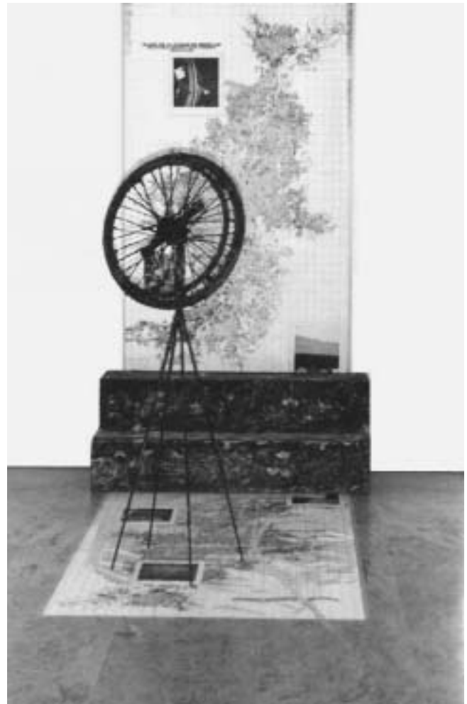
Without borders - Installation

pan and the United States to share our experiences as disabled artists in front of the world. In 1998 I was awarded at the IX National Contest of Artists Universidad de Antioquia in Medellin,