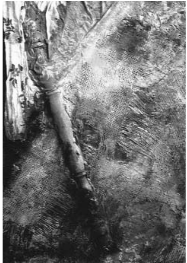
Untitled - Mixed media (No. 48)

which makes them identical. So, I build up an interaction between walker and not-walker , nomadic and sedentary people in the city, which creates with its thresholds imperceptible, almost utopian limits, as well as a relation with the