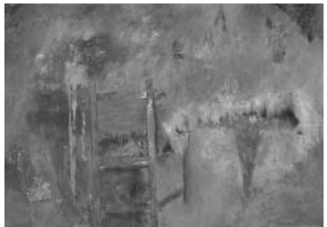
Untitled - Mixed media (No. 50)

This project's artworks have been made in different years, but all of them, as a whole, have formed a project of living called A life without borders ; I'll continue to make contemporary artworks about disability as long as the disease allows me to do so.