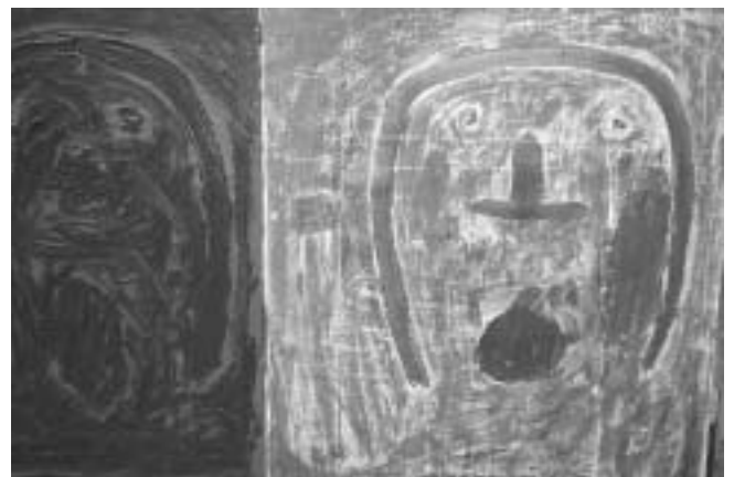
Taga Tazezo: Ohne Titel