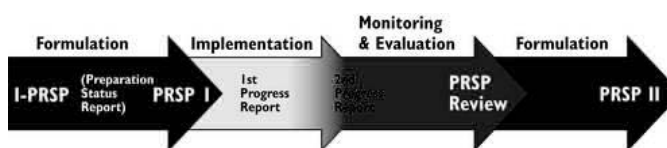
Figure 2: Stages in the PRSP Formation Process

since the very onset of this poverty alleviation model in 1999/2000. As Figure 2 illustrates, the PRSP process dictates that it be essentially predicated upon broad-based consultations of all layers of society, involving the poor themselves as its integral part (ILO 2002). A substantive reading of all of the PRSP regimes so far formulated and implemented by Ethiopia reveal that disability has hardly been considered as a matter of serious development concern. Three PRSP documents have been formulated by the Ethiopian government between 2000-2011. Representatives of PWDs interviewed in this study have all provided firsthand accounts of the actual level of involvement by PWDs and their organisations in the processes and subsequent adoptions of the three PRSP documents.